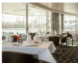
Portobellos /L' Amour 義大利、法國或葡萄牙美食