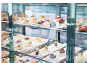
River Café 全天餐飲選擇小吃