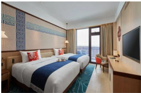
麗緻房-帶陽台 - 客房非常適合喜愛舒適空間和現代感的情侶和小家庭*。淺色調的木材和米色家具整體色調照亮了空間。地毯和牆紙上五顏六色的民族圖案代表慶祝滿族文化，營造出溫馨的氛圍，為房內增添了一絲活力。