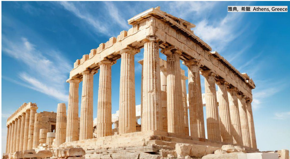
雅典, 希臘 Athens, Greece