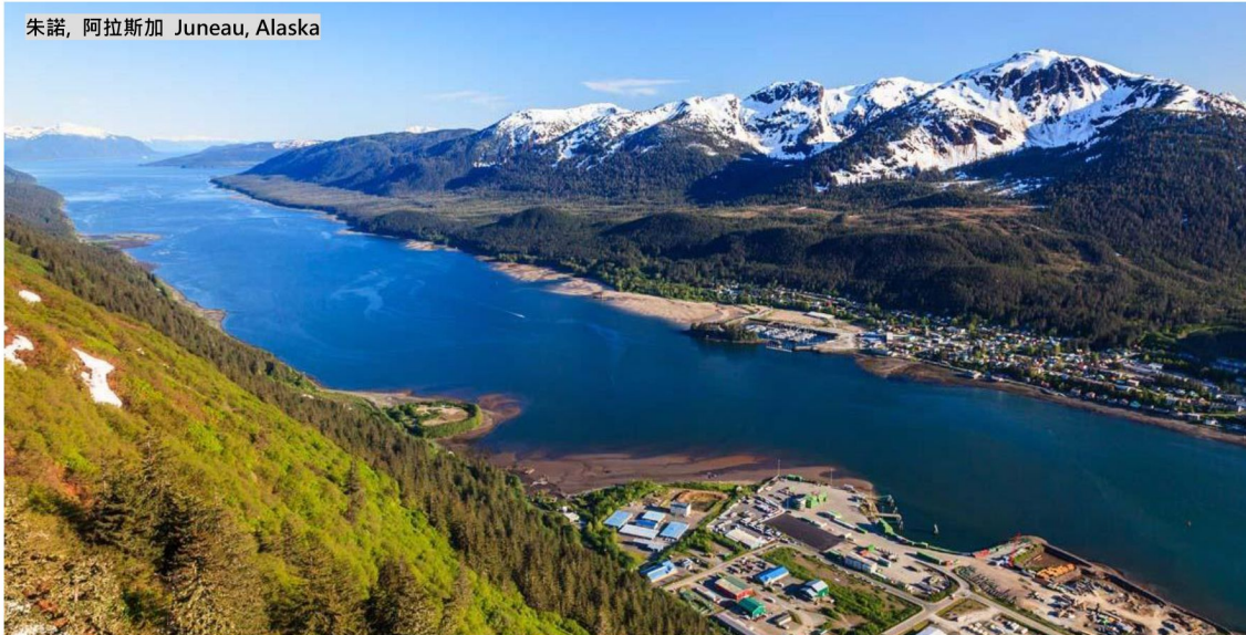
朱諾, 阿拉斯加 Juneau, Alaska