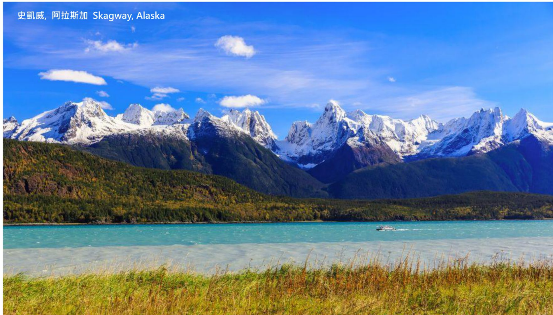
史凱威, 阿拉斯加 Skagway, Alaska