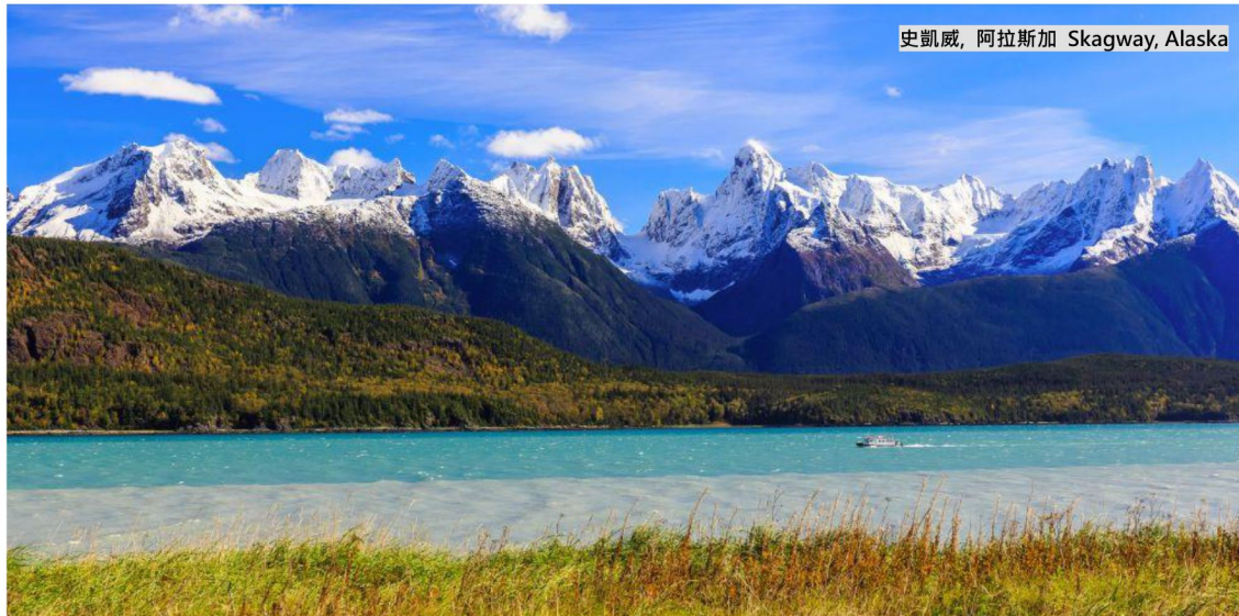
史凱威, 阿拉斯加 Skagway, Alaska