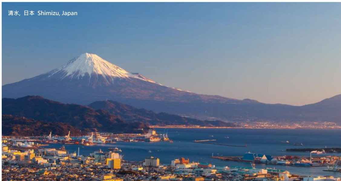
清水, 日本 Shimizu, Japan