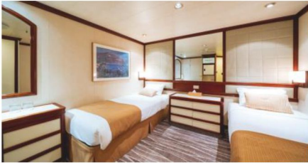
內艙房 Inside Cabin /