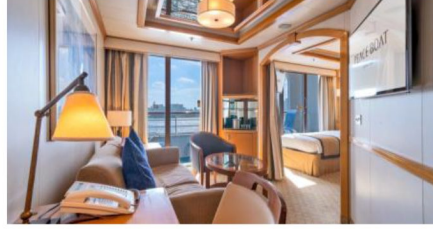
迷你套房 Junior Suite