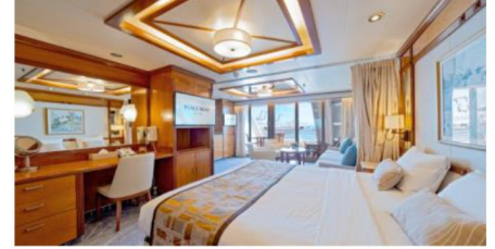
Premium Suite 豪華套房