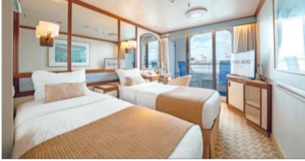
露台艙房 Balcony Cabin