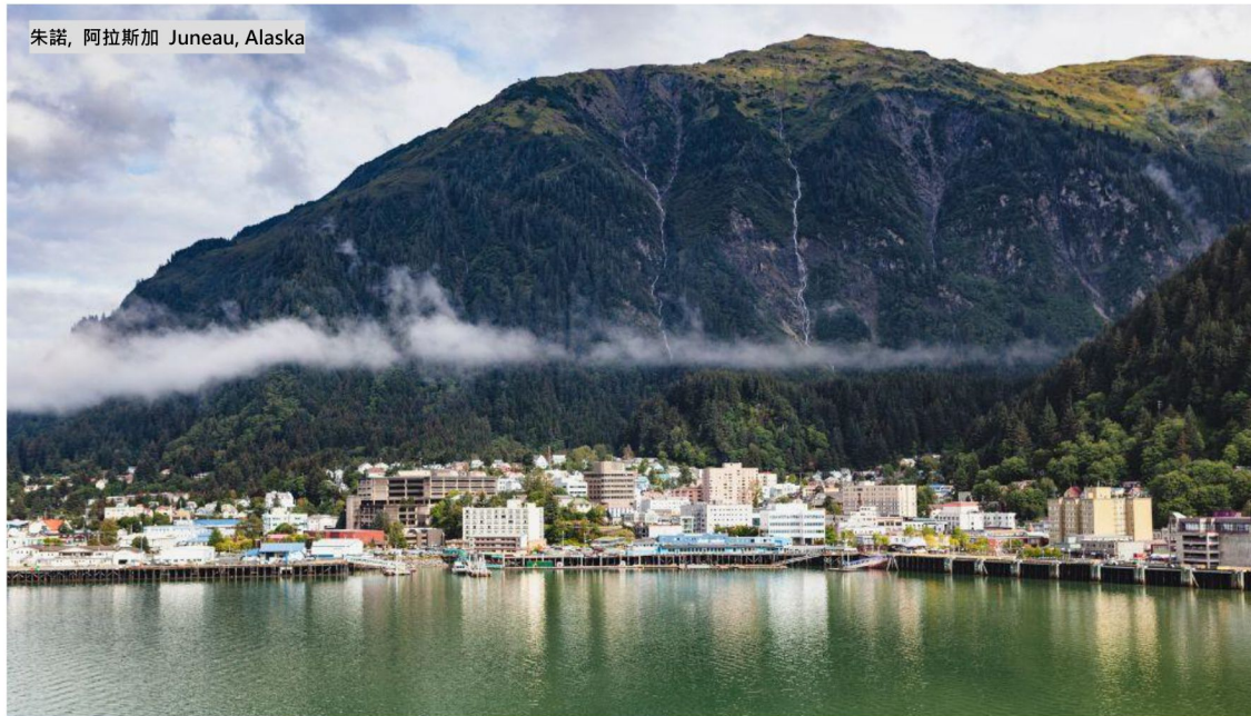
朱諾, 阿拉斯加 Juneau, Alaska