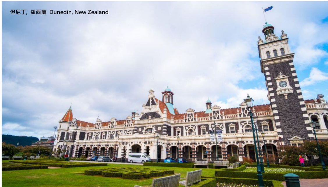
但尼丁, 紐西蘭 Dunedin, New Zealand