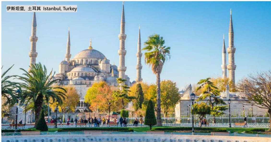
伊斯坦堡, 土耳其 Istanbul, Turkey

Regent SEVEN SEAS CRUISES AN UNRIVALLED EXPERIENCE™