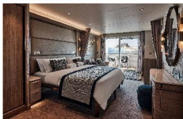
Classic Veranda Suite (33.1 sq.m., Incl. Veranda)