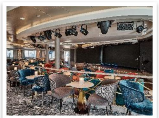
船上 Explorer Lounge