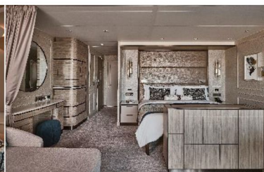
Silver Suite (49.7 sq.m., Incl. Veranda)