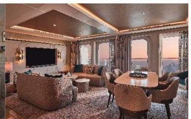
Grand Suite (155 sq.m., Incl. Veranda)