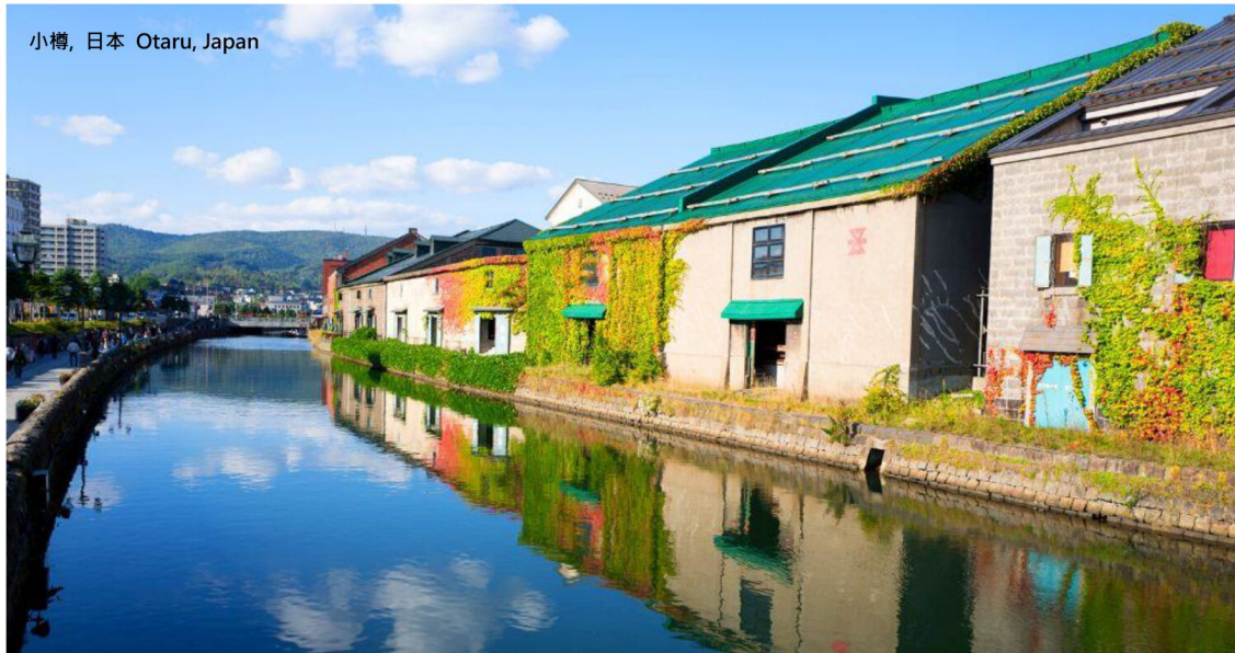
小樽, 日本 Otaru, Japan