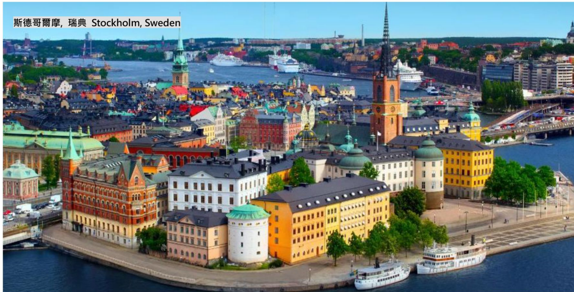
斯德哥爾摩, 瑞典 Stockholm, Sweden