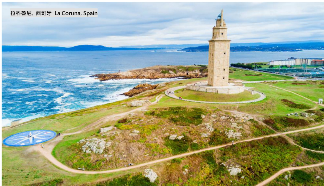
拉科魯尼, 西班牙 La Coruna, Spain