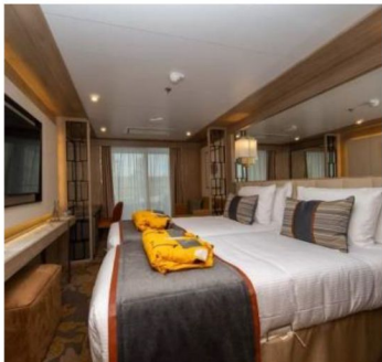
Veranda Suite (Size: 215 sq. ft.)

World Explorer 首航年份 Inaugural: 2019 年 | 載客 Passengers: 172 人 (極地航程: 140 人) | 總噸位 Gross Tonnage: 9,923 噸 | 冰級 Polar Class: 1B