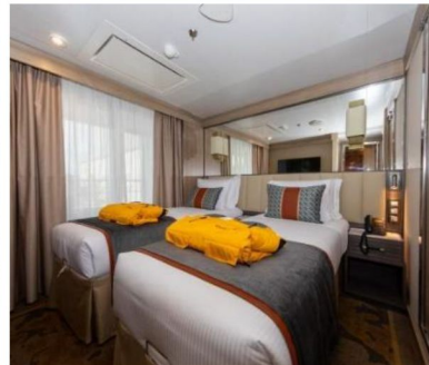
Superior Suite (Size: 278 sq. ft.)