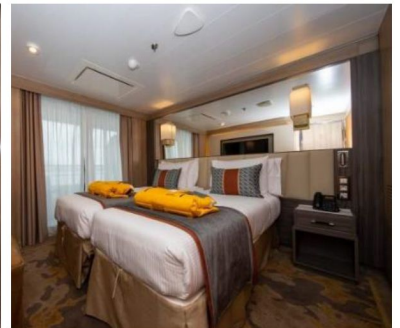
Owner's Suite (Size: 355 sq. ft.)

一場充滿登陸活動與極地體驗的精彩旅程。 為期 4 天的探險旅程提供了充足的機會，令你面向最佳的野生動物觀賞角度，在自然棲息地見證海豹、鯨魚、各種鳥類和南極最具標誌性的居民企鵝，並加入引人入勝的短途旅程：徒步於廣闊而白茫茫的一片大地上，拍攝野生動物照片或純粹欣賞風景，甚至於滿天星斗的極地上露營等，探索獨特的南極景觀。