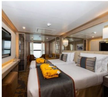
Infinity Suite (Size: 270 sq. ft.)