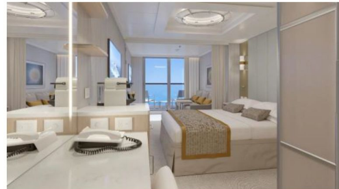
迷你套房 Mini Suite - 303 sq. ft.