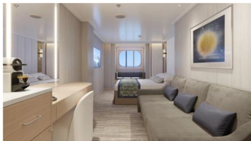
海景房 Premium Oceanview - 212 sq. ft.

太陽公主號 她是第三艘以“太陽公主”命名的郵輪，是公主郵輪有史以來最大型的郵輪，亦是船隊中第一艘以液化天然氣 (LNG) 提供動力的郵輪，這種燃料亦減少對環境的污染。全新艙房級別體驗，當中包括獨享的休閒設施及特色餐廳等..... 將於 2024 年 2 月正式下水，為旅客帶來獨特的地中海郵輪新體驗。