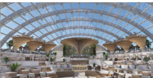
The Dome 是一個多層有蓋甲板，是遊輪上建造的首個真正的玻璃封閉圓頂