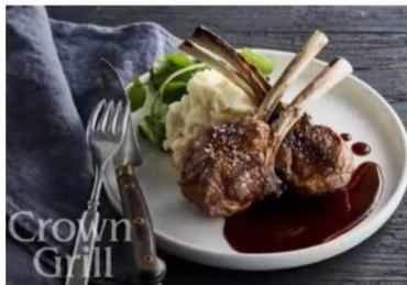
Crown Grill 曾被評為最佳遊輪牛排館