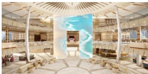
Princess 標誌性中庭 Piazza，提供外向懸浮空間，舒適的座椅和可欣賞海景的區域