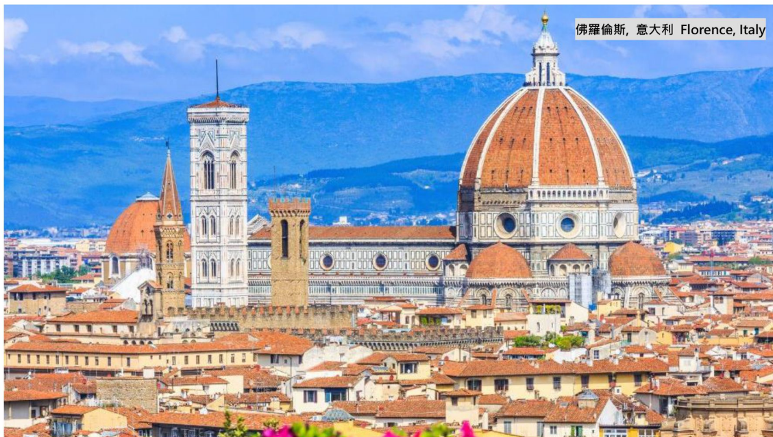
佛羅倫斯, 意大利 Florence, Italy