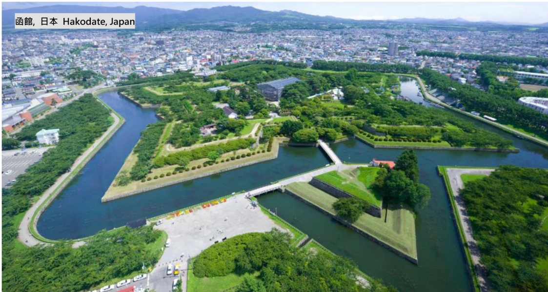
函館, 日本 Hakodate, Japan