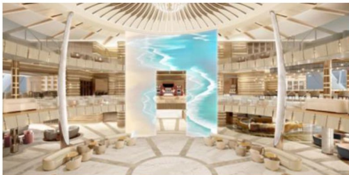
Princess 標誌性中庭 Piazza，提供外向懸浮空間，舒適的座椅和可欣賞海景的區域