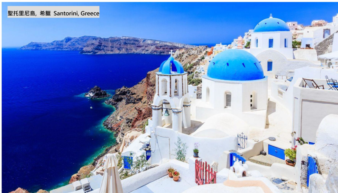
聖托里尼島, 希臘 Santorini, Greece