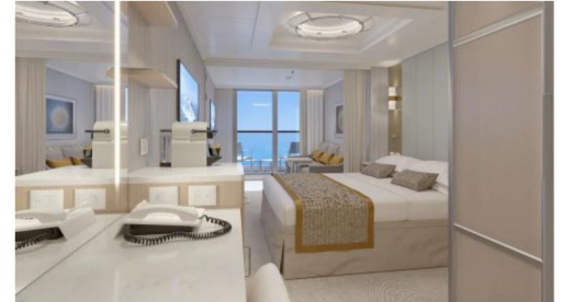
迷你套房 Mini Suite - 303 sq. ft.