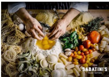
Sabatini's 莎芭堤妮餐廳，公主遊輪的主打餐廳