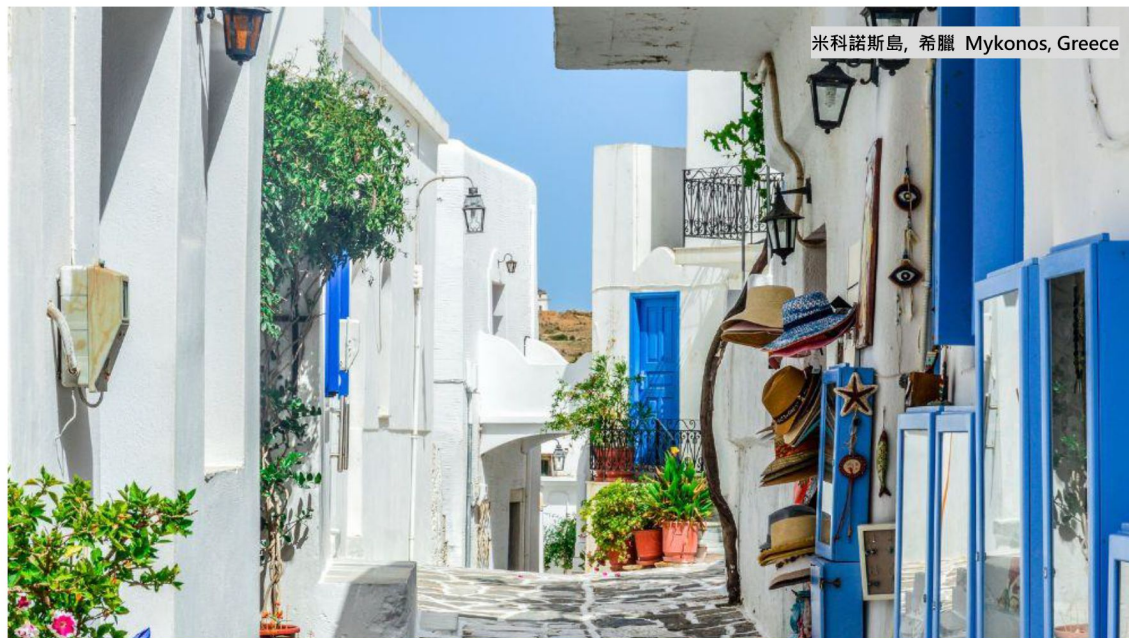
米科諾斯島, 希臘 Mykonos, Greece