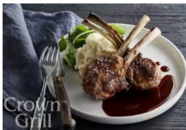
Crown Grill 曾被評為最佳遊輪牛排館