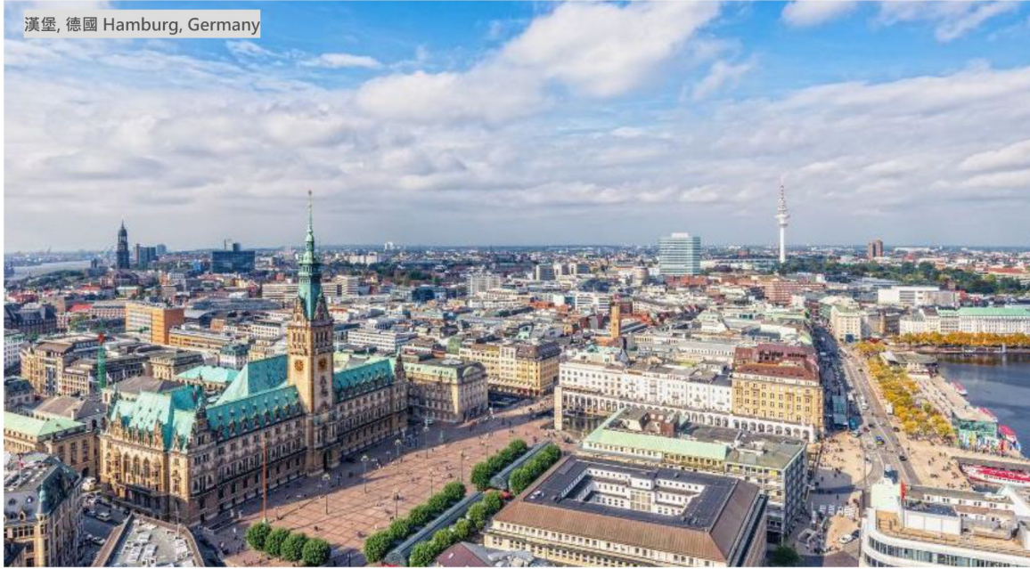
漢堡, 德國 Hamburg, Germany