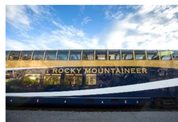
Rocky Mountaineer Tour 8930 only