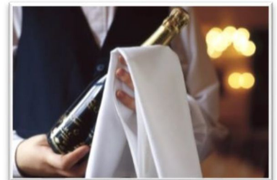
Scenic Bulter 專業管家