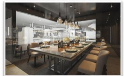
Chef's table 主廚特色餐廳