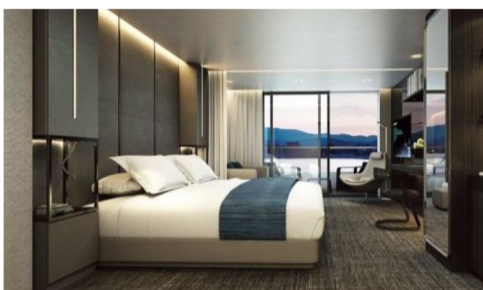
露台房 Verandah Suite (32m2 / 344ft2)