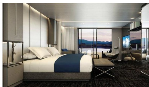
豪華露台房 Deluxe Verandah Suite (34m2 / 366ft2)