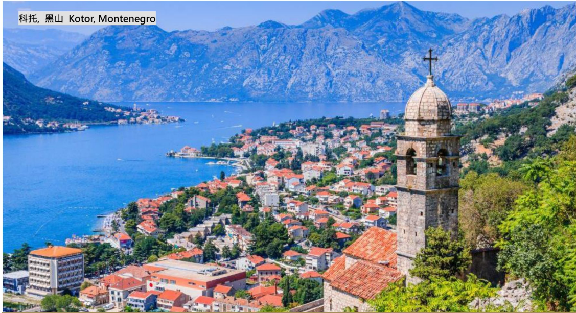
科托, 黑山 Kotor, Montenegro