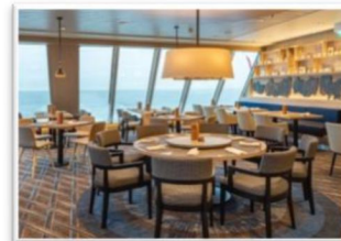
Aune Main Dining