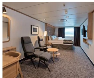
尊貴露台房 Arctic Superior (Cat.TT) (15 – 27 m 2 / 161 – 291 sq2) (Cat. TY, TT, 不設露台)