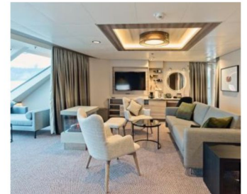
大型露台套房 XL Suite w/balcony (Cat. MA) (46 – 48 m 2 )