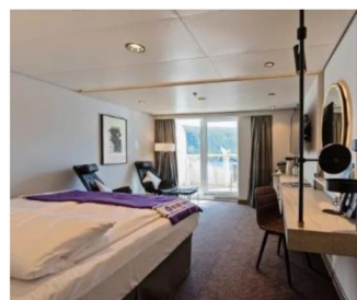
露台套房 Suite - With balcony (Cat.ME) (20 – 28m 2 )