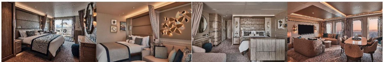
Classic Veranda Suite (33.1 sq.m., Incl. Veranda)