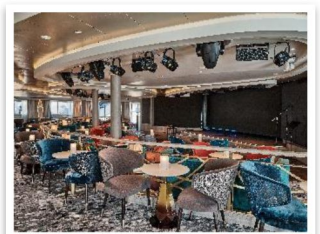
船上 Explorer Lounge