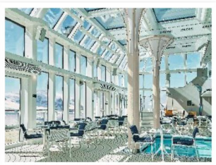
Pool Deck & The Grill