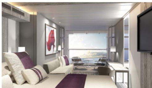
Edge Staterooms with Infinite Veranda

曾負責設計杜拜帆船酒店的英籍名建築設計師 Tom Wright，獲邀為郵輪設計 Magic Carpet。這是個設於船邊的大型可升降平台，當在 2 樓、5 樓、14 樓及 16 樓停泊，變身戶外甲板、泳池區的延伸、接駁艇等候區域，或變成無邊際海景餐廳等不同功能，成為海上魔氈。