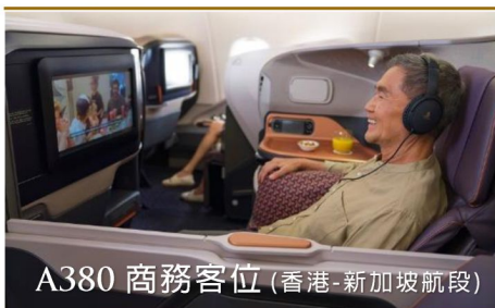
A380 商務客位 (香港-新加坡航段)