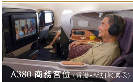
A380 商務客位 (香港 - 新加坡航段)

星級之選 以 Garden-In-A-Hotel 為概念，耗資 4500 萬新元翻新，由 John Portman 傾心打造，設有 Sky-Bridge、13 米高植物牆