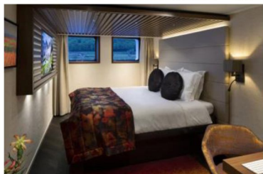
Fixed Window (Cat. E) 205 sq. ft.

船上高達 88% 以上的艙房皆設有私人露台。露台房的面積亦達 205-355 sq. ft. 另外更設有 6 間 474 sq. ft. 的 Grand Suites 及 1 間 710 sq. ft. 的 Owner' s Suite。除了更大更舒適的艙房外, 船上載客亦只載 196 人, 令船上的空間感更大!