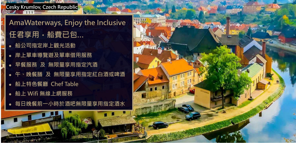
Cesky Krumlov, Czech Republic