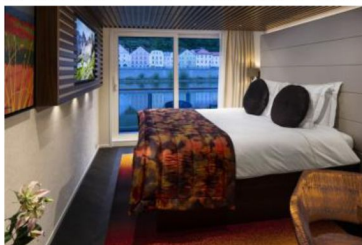
Outside Balcony (Cat. AB) 252 sq. ft.