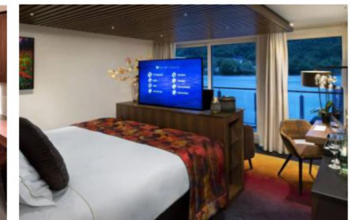
Outside Balcony (Cat. GS) 474 sq. ft.