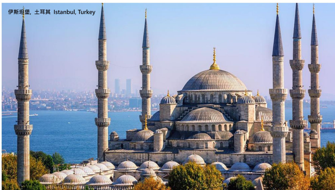
伊斯坦堡, 土耳其 Istanbul, Turkey