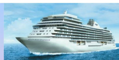
Regent SEVEN SEAS CRUISES AN UNRIVALLED EXPERIENCE™