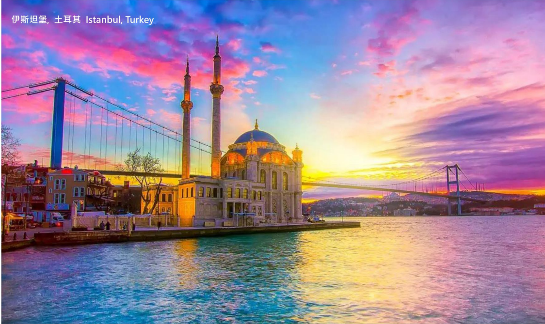
伊斯坦堡, 土耳其 Istanbul, Turkey