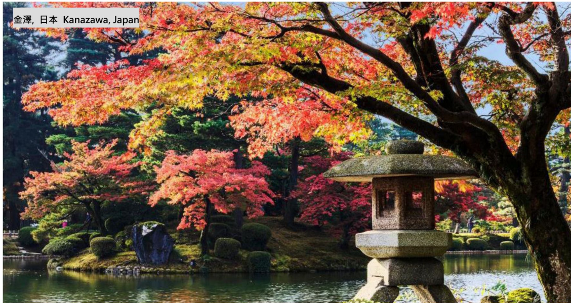
金澤, 日本 Kanazawa, Japan