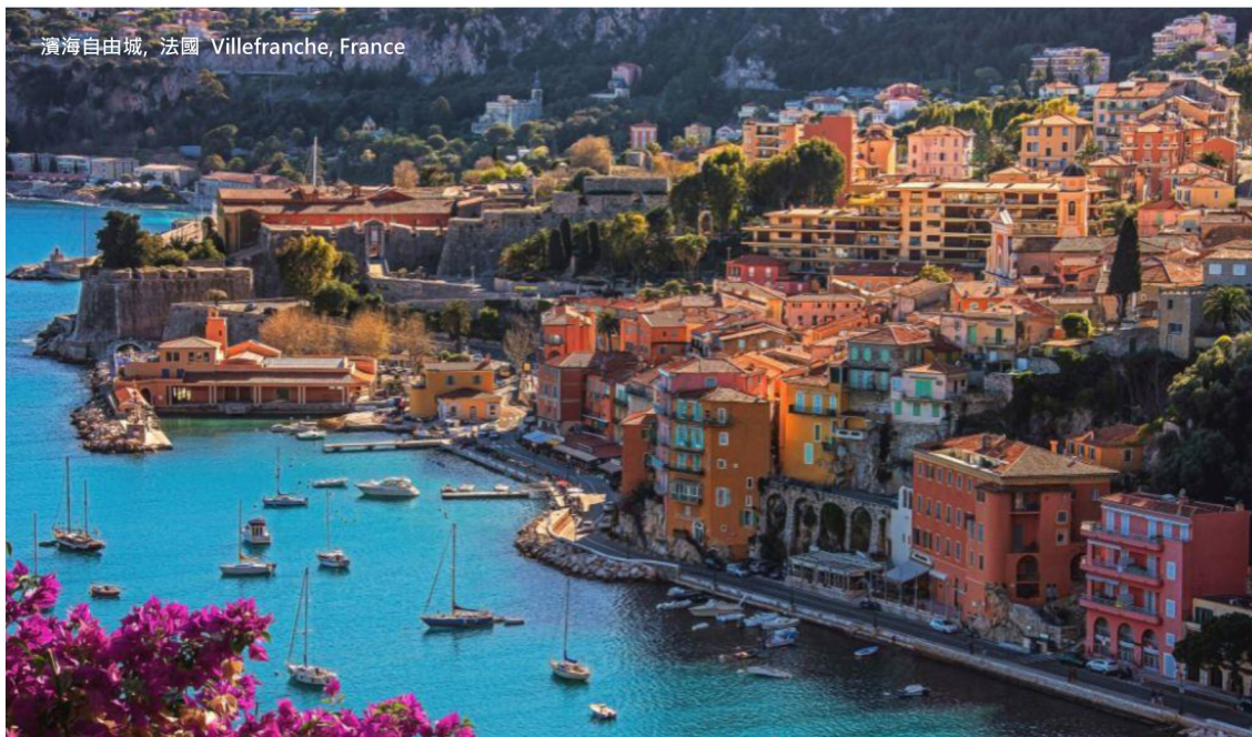
濱海自由城, 法國 Villefranche, France

CUNARD THE MOST FAMOUS OCEAN LINERS IN THE WORLD