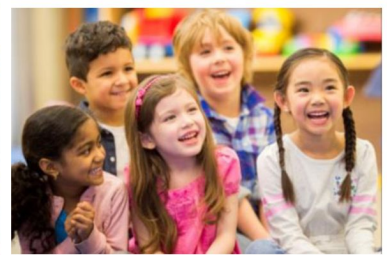
Reimagined youth & Teen Clubs 啟發小童對未知事物的興趣