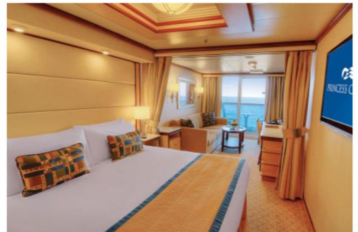
迷你套房 Mini Suite