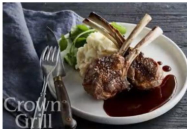
Crown Grill · 曾被評為最佳遊輪牛排館