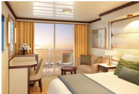
尊貴露台房 Deluxe Balcony Suite