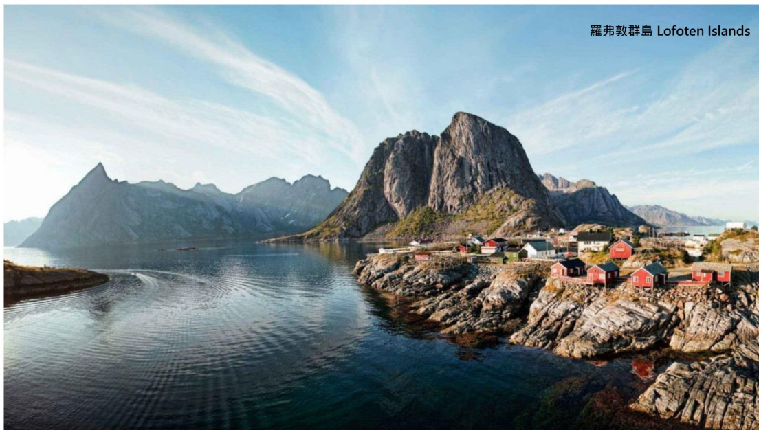
羅弗敦群島 Lofoten Islands