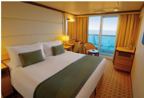
露台房 Balcony Suite

星空公主號 為 Royal Class 系列第四艘旗艦郵輪，船身設計和內部裝潢不僅延續了前 Royal Class 郵輪的成功經驗，還進行了改良和升級。星空公主號汲取了公主郵輪享譽全球的標誌性元素和無與倫比的賓客體驗，並集合姐妹郵輪上的亮點設施和產品於一體。當中包括一些休閒設施及特色餐廳等..... 將於 2019 年 10 月正式下水，為旅客帶來獨特的地中海郵輪新體驗。