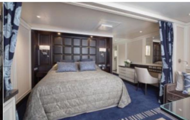
禮賓級套房 Concierge Suite (約 30.8 sq m)