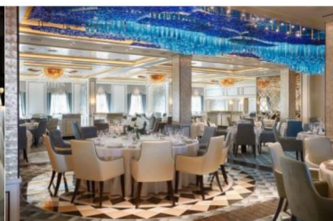
Compass Rose 船隊旗艦主餐廳