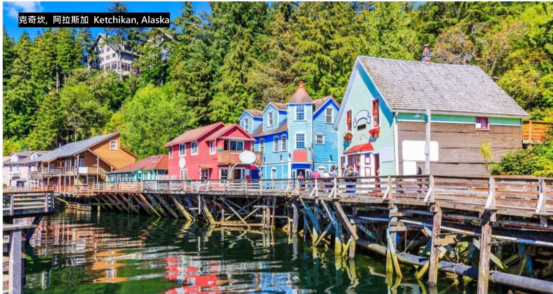
克奇坎, 阿拉斯加 Ketchikan, Alaska