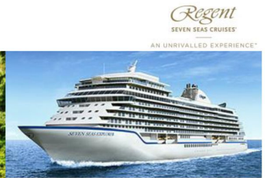
Regent SEVEN SEAS CRUISES AN UNRIVALLED EXPERIENCE