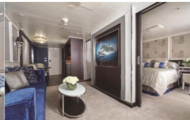
套房 Penthouse Suite (約 41.8 sq m)