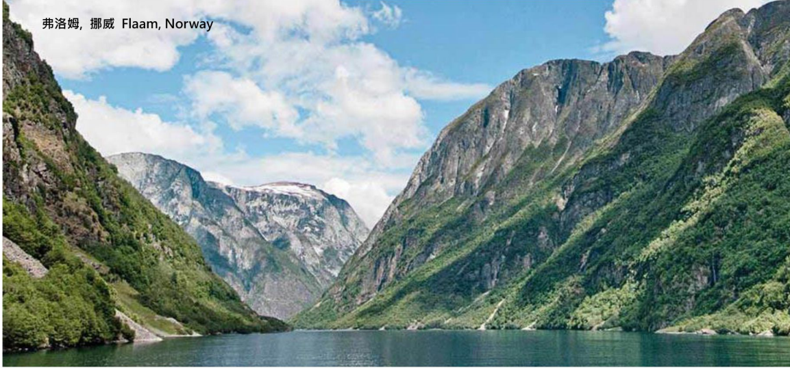
弗洛姆, 挪威 Flaam, Norway