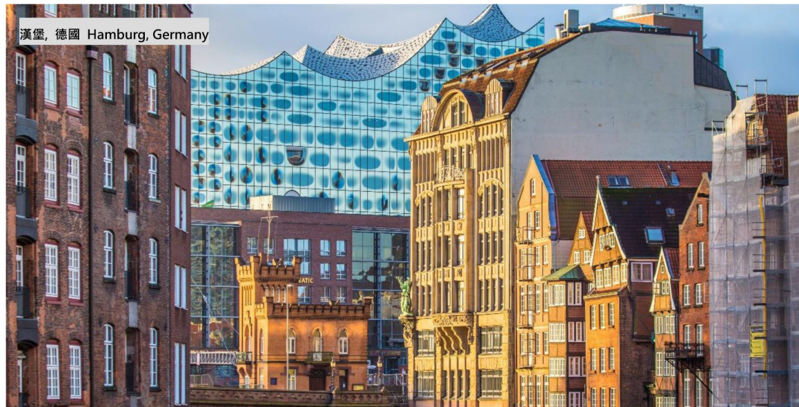
漢堡, 德國 Hamburg, Germany