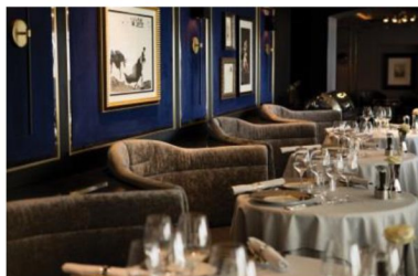
Prime 7 美式扒房

麗晶七海郵輪的精緻美饌亦一直享譽業界，其中船上的扒房 Prime 7 使用玻璃、金屬和花崗岩精心裝飾，在各方面都彰顯出經典格調，豪華品質。而旗艦主餐廳 Compass Rose 則在設計時頗為用心，採用精美的木材與淺色大理石和閃亮的珍珠母互相映襯，配以藍色、白色、金色和銀色的燈光色彩，顯得極為雅致。配合船上的精選佳釀，勢必滿足您對美食的完美追求。加上 Pacific Rim 為客人提供了亞洲菜式，令船上的餐膳選擇更趨多元化以滿足你對不同地方美食的追求。