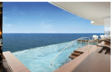
Infinity Pool 無邊際泳池