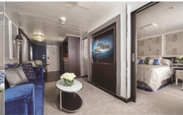
套房 Penthouse Suite (約 41.8 sq m)