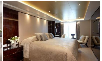
七海套房 Seven Seas Suite (約 53.6 – 60.8 sq m)

麗晶七海郵輪的精緻美饌亦一直享譽業界，其中船上的扒房 Prime 7 使用玻璃、金屬和花崗岩精心裝飾，在各方面都彰顯出經典格調，豪華品質。而旗艦主餐廳 Compass Rose 則在設計時頗為用心，採用精美的木材與淺色大理石和閃亮的珍珠母互相映襯，配以藍色、白色、金色和銀色的燈光色彩，顯得極為雅致。配合船上的精選佳釀，勢必滿足您對美食的完美追求。加上 Pacific Rim 為客人提供了亞洲菜式，令船上的餐膳選擇更趨多元化以滿足你對不同地方美食的追求。