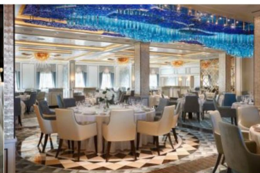
Compass Rose 船隊旗艦主餐廳