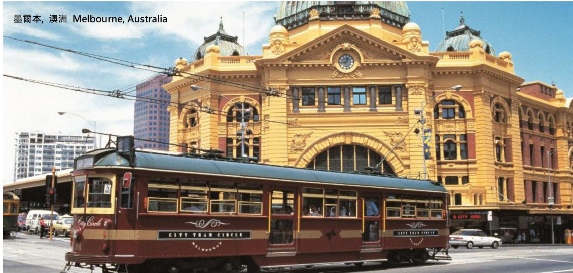
墨爾本, 澳洲 Melbourne, Australia

Regent SEVEN SEAS CRUISES AN UNRIVALLED EXPERIENCE™