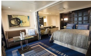
露台套房 Deluxe Veranda Suite (約 23.5 sq m)

七海探索者號 Seven Seas Explorer 是麗晶七海郵輪於 2016 年 7 月正式下水服役的頂級郵輪。這艘船對麗晶七海郵輪而言具有相當特別的意義，因為這是其打算用來重新定義頂級郵輪體驗的代表作，亦被稱為「有史以來造價最昂貴的一艘頂級郵輪」 THE MOST LUXURIOUS SHIP EVER BUILT™。麗晶七海郵輪完美結合了寧靜與繁華，為乘客提供了高雅奢華的全包式航遊體驗、舒適寬敞的船上空間、97% 艙房設有私人露台、貼心細緻的服務及船上各類高檔設施皆是讓七海郵輪廣受業界好評的原因，而當中套房級 Penthouse Suite 以上更提供專業管家服務！