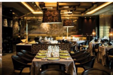
Pacific Rim 亞洲餐廳