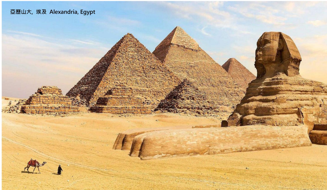
亞歷山大, 埃及 Alexandria, Egypt