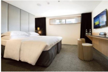
Standard Suite (160 ft 2 )