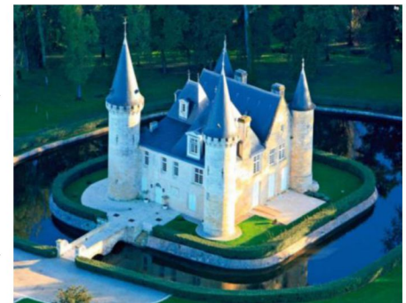
於阿加薩克城堡 Château d' Agassac 欣賞音樂會