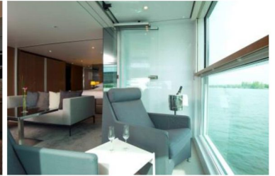
Royal Panorama Suite (269 ft 2 )