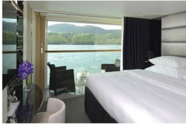
Balcony Suite (205 ft 2 )