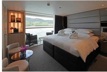
Junior Balcony Suite (250 ft 2 )