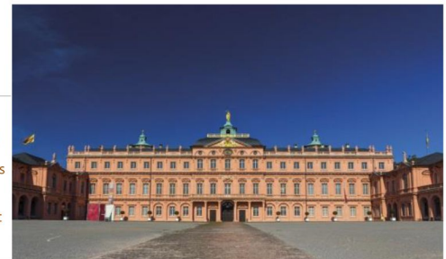
Enrich: Baroque Palace of Rastatt 享受私人音樂會