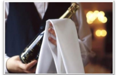
Scenic Butler 專業管家