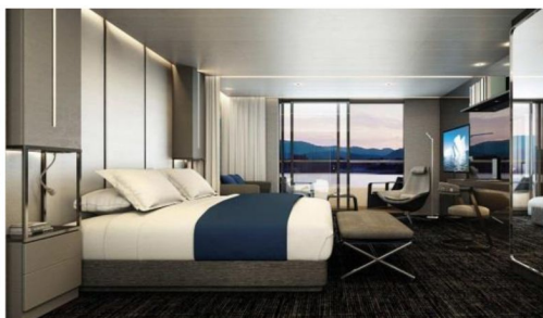
豪華露台房 Deluxe Verandah Suite (34m 2 / 366ft 2 )