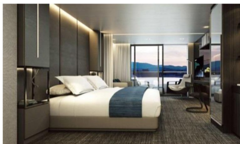
露台房 Verandah Suite (32m 2 / 344ft 2 )