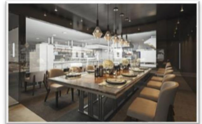
Chef's table 主廚特色餐廳