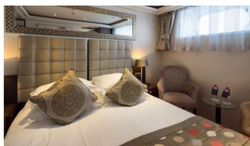
河景房 (Size: 約 160 sq. ft)