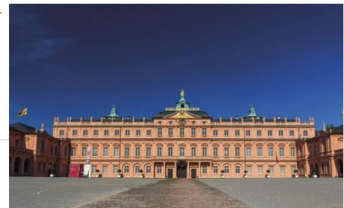
Enrich: Baroque Palace of Rastatt 享受私人音樂會

*以下航程為倒走航程, 詳情請向本公司職員查詢: Scenic Opal: 12 月 12, 14 日。