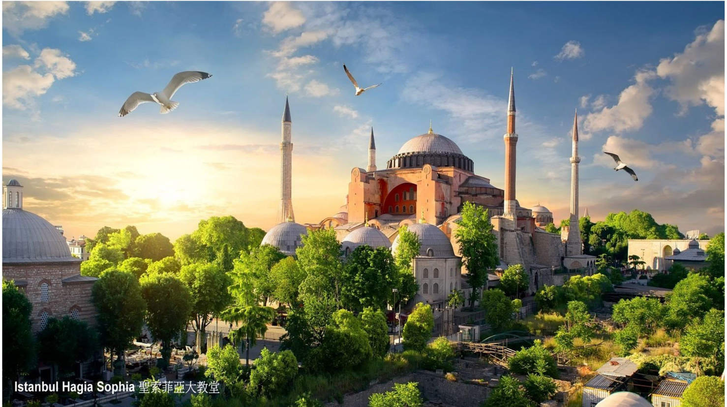
Istanbul Hagia Sophia 聖索非亞大教堂