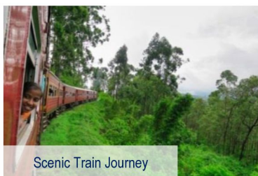
Scenic Train Journey