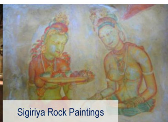
Sigiriya Rock Paintings